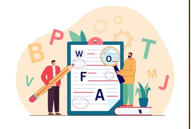
Fig class will be recording the spellings they are working on in their planners. Please support them with these at home.