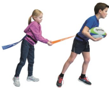
Fig will be working on Tag Rugby and Football this half term. The students will be working on communication, passing, running and shooting or scoring, especially when under pressure. They will learn some of the rules for each